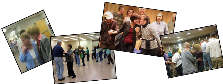
Caring and Sharing in the Community

The foundation offers an annual, free, educational symposium, supports the efforts of many charitable organizations involved in the development of education and wellness programming for the Parkinson community, such as exercise and dance classes, and offers funding for local and national PD research. The foundation also maintains contact and general information for the Parkinson Support Groups in the 16 counties that it serves, and maintains a website with local and national PD resources.