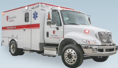
Stony Brook Stony Brook, NY