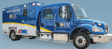
URMC Rochester, NY