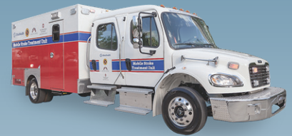
Ohio Health Columbus, OH