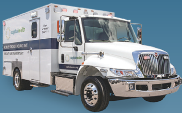
Capital Health Trenton, NJ