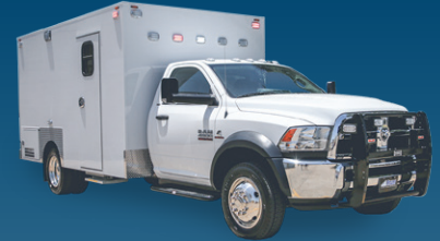
Mercy Health Toledo, OH