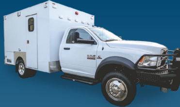
UCHealth Aurora, CO