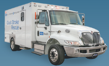
UCLA Health Los Angeles, CA