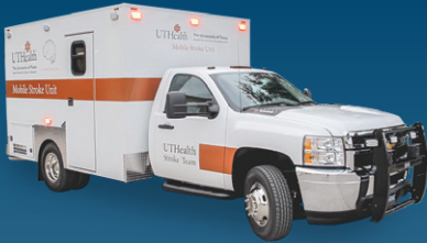
Houston Mobile Stroke Unit Houston, TX

2 out of 3 Mobile Stroke Units in the United States are built by Frazer.