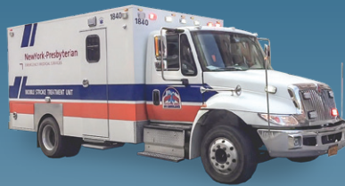
NewYork-Presbyterian New York, NY