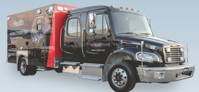
UC Health Cincinnati, OH