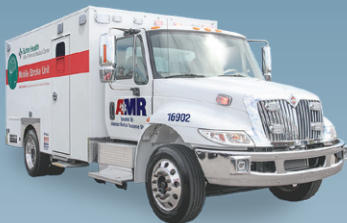
Mills-Peninsula Burlingame, CA