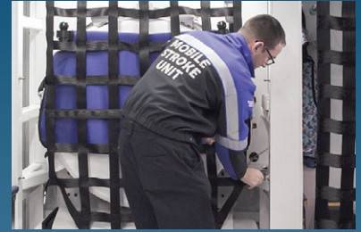
CT Scanner Mounting & Retention System