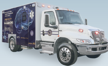
Jefferson Health Bensalem, PA