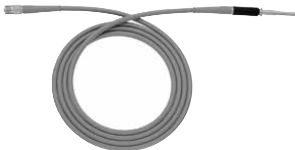
495 NA Fiber Optic Light Cable , with straight connector, diameter 3.5 mm, length 230 cm